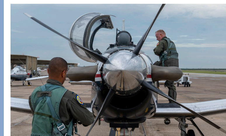
Laughlin (Del Rio) Air Force Base